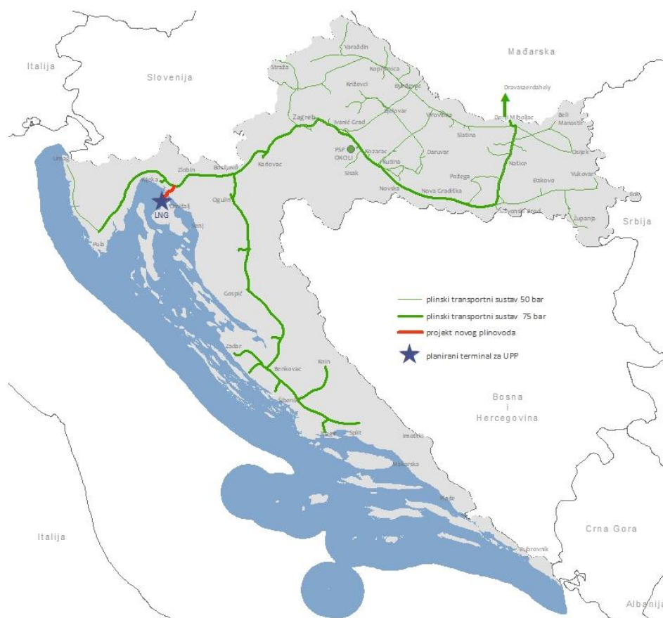
Figure 1 The existing transmission system of Plinacro, location of the LNG terminal and Omišalj-Zlobin gas pipeline

on 25.1.2018 50% of eligible cost (EUR 16.433.500) for the construction works of Phase I ( https://ec.europa.eu/inea/en/connecting-europe-facility/cef-energy/construction-works-lng-evacuation-gas-pipeline-section-omi%C5%A1alj ). Omišalj-Zlobin gas pipeline is in the phase of a building permit obtaining. The completion of the gas pipeline construction has been planned in 2019, and its commercial commissioning has been planned in the gas year 2019/2020, depending on the construction and commissioning of the infrastructure of the LNG terminal.